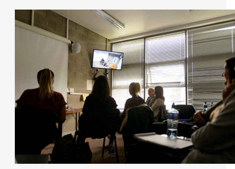
Figure 2: Students watch a video clip for discussion in class

opportunity to meet learning outcomes, preferably with the same opportunities for engagement offered to all students. Implementation of this principle includes the provision of accessible class materials.