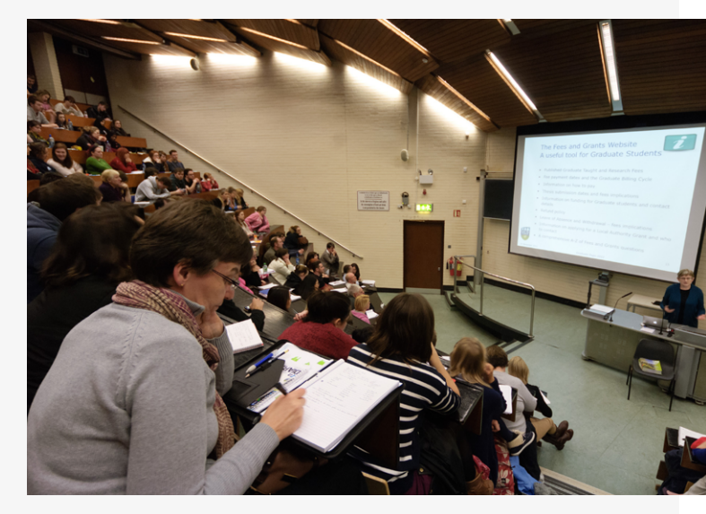
Figure 5: A student taking notes in a lecture

Policies should include conditions of use and restrictions on distribution. Faculty might also consider allowing students to complete in-class tests using a computer thus minimising the amount of time a student must spend writing/rewriting and allowing for more time processing questions and composing answers.