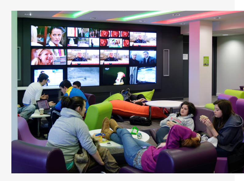
Figure 1: Students relaxing in UCD's Global Lounge

At the core of Universal Design is a focus on variety and choice for students, a movement away from the traditional didactic, often solely text-based, classroom practices of the last century and the embracing of a more dynamic, active and evolving classroom.