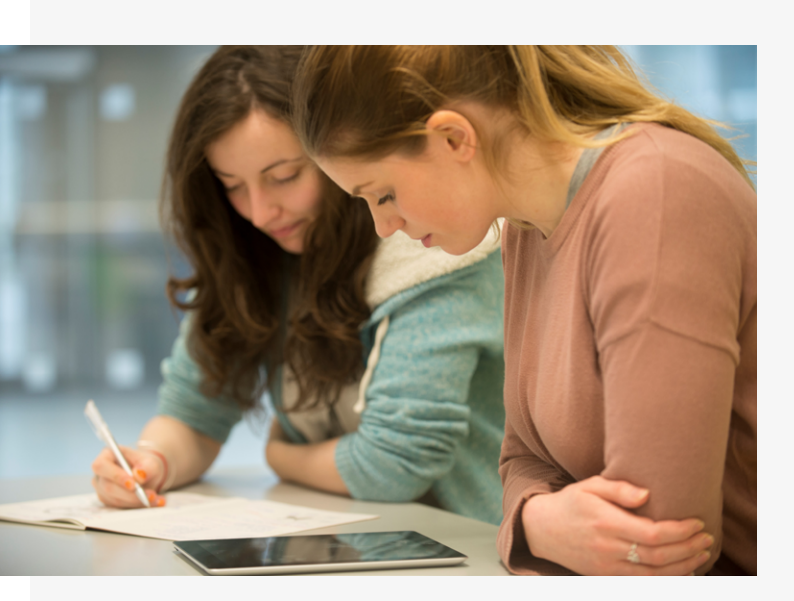
Figure 4: Students reading and studying together

This principle further highlights the need for all material to be provided in an accessible format for all students. A simple strategy for all lecturers to improve accessibility is to use a sans-serif font such as Ariel with a minimum font size of 24 in PowerPoint. Creating alternative format materials is often a costly and problematic practice which can result in loss of equality for students and a significant investment of time during busy term time from faculty and support staff. Providing online or digital versions of texts removes a number of barriers for students including cost and often accessibility.