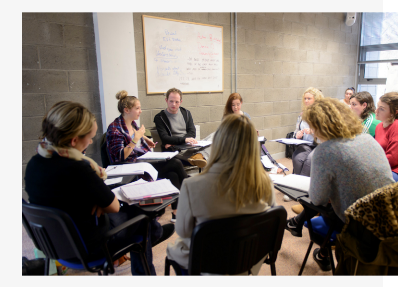
Figure 8: Students working together in class

This statement should encourage tolerance of diversity in the classroom and should reassure those who would like to disclose information about their learning needs that this information will remain confidential and be treated with respect. Often disclosure can be difficult for students with 'hidden' disabilities so this encouragement is needed. It is the responsibility of teaching staff to communicate that all students will have 'equal access and equal opportunity' (Higbee, Chung, & Hsu p. 63). Pedelty (2003) emphasises the need for teaching staff to discuss this statement in their first class so that students are not left to merely read the statement on their own.