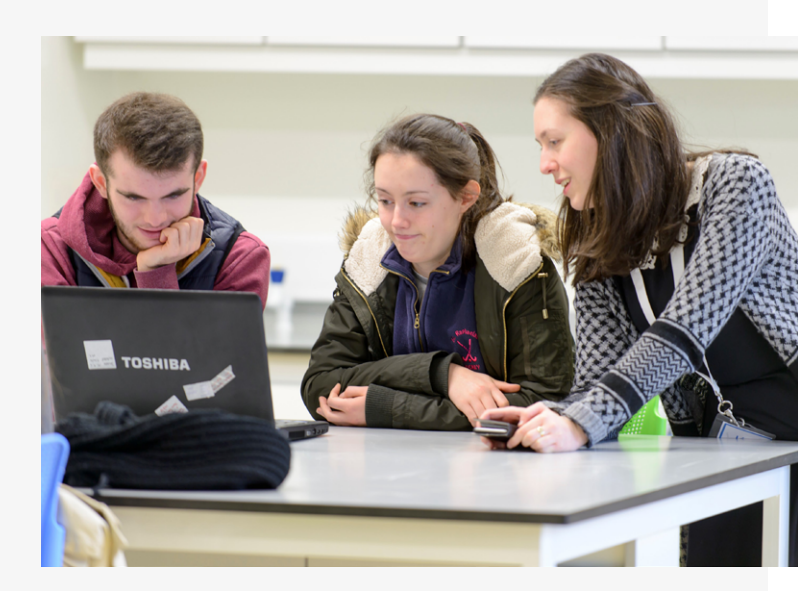
Figure 7: Students studying together

to form study/discussion groups for each module. Study groups could be established in class and students encouraged to meet outside of class time where possible. Group study topics/questions can be set to help structure the study time and boundaries can